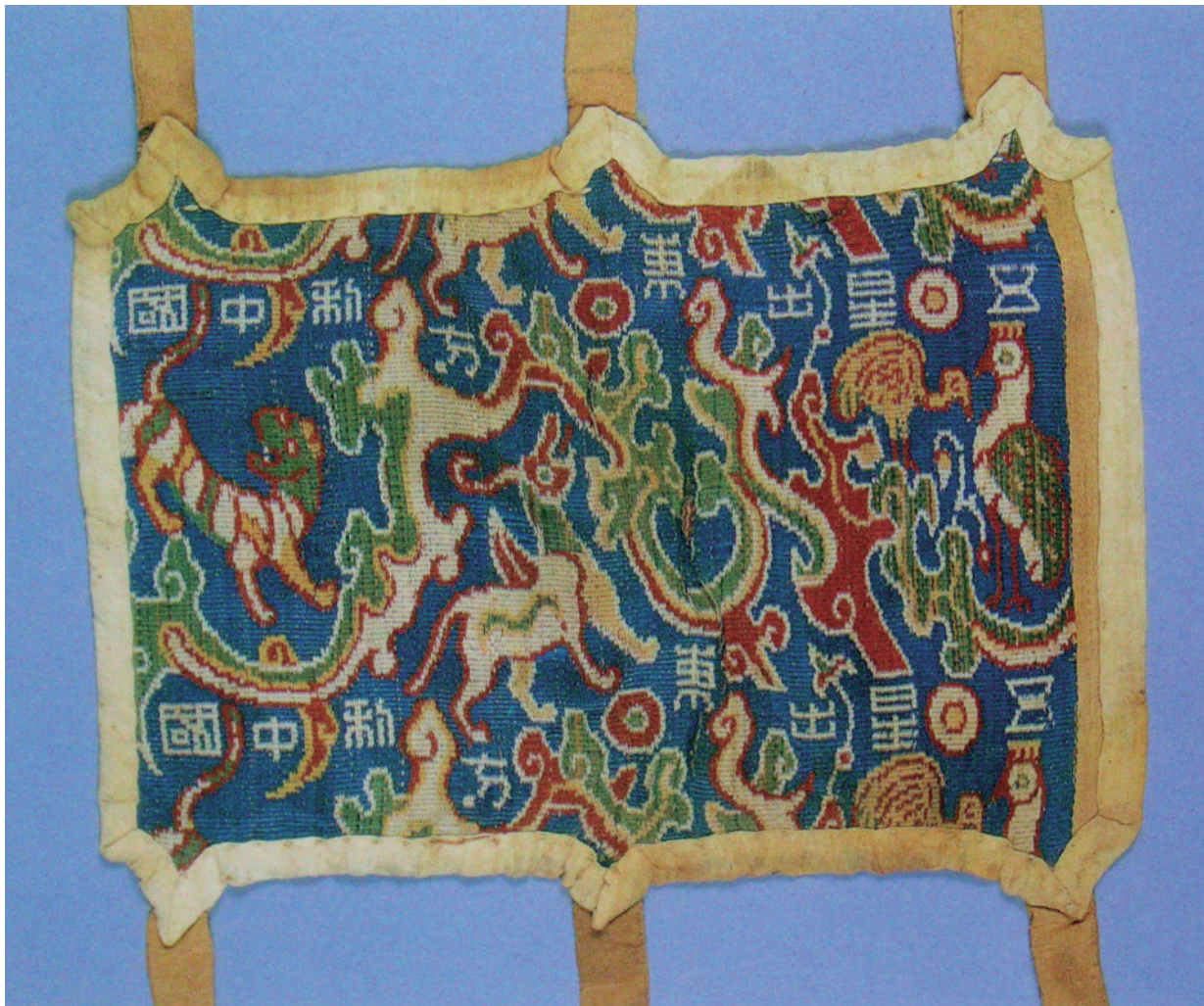
"Five stars rise in the east, benefitting China"

very important cultural messages. It was stated in Records of the Grand Historian · Astronomy that, "Five stars rising in the eastern sky is auspicious to China"(Sima Qian, 2015, p.186). There are similar records in Book of Han , Book of Jin , and Book of Sui . Scholars generally believe that the five stars refer to Chenxing, Taibai, Yinghuo, Suixing and Zhenxing, corresponding to Mercury, Venus, Mars, Jupiter and Saturn respectively. According to explanations of Confucian scholars in ancient times, if the five stars all appear in the eastern sky, it is auspicious for the central plains dynasty to send armies beyond