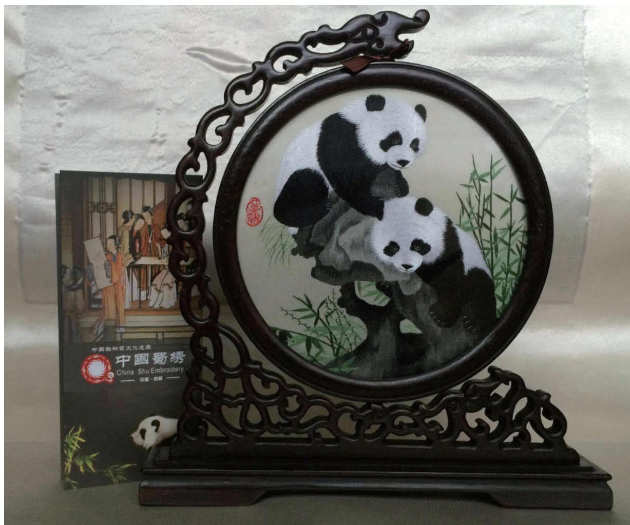
embroidery of different panda images on both sides of a fabric as been created with double-faced embroidering skills

name from the lucrative trade in silk carried out along its length. The term was coined by Ferdinand Freiherr von Richthofen, a geologist and geographer from Germany, in his works titled China: The results of my travels and the studies based thereon in 1877. He wrote that from 114 BC to AD 127, there was a route connecting China with Xiyu (including Central Asia and India) with silk trade as the medium and he gave it the name “the Silk Road(s),” which later gained widespread acceptance and popularity among the public. But the connotation, value and significance of this term have gone far